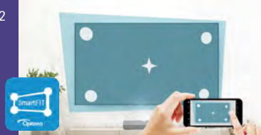
Image alignment system ensures hassle free setup using a smartphone.